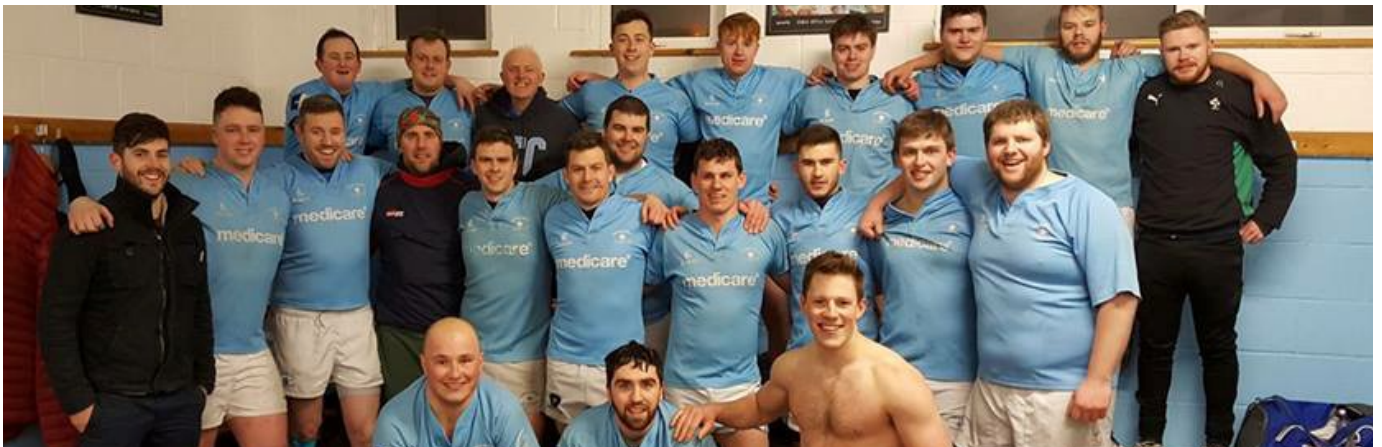
For the second season in a row the third's side will meet Richmond in a local derby in the Gleeson League final (don't worry he had shorts on!)

The lads in the third's side have to wait patiently for their date with destiny against Richmond in the Gleeson league Final.